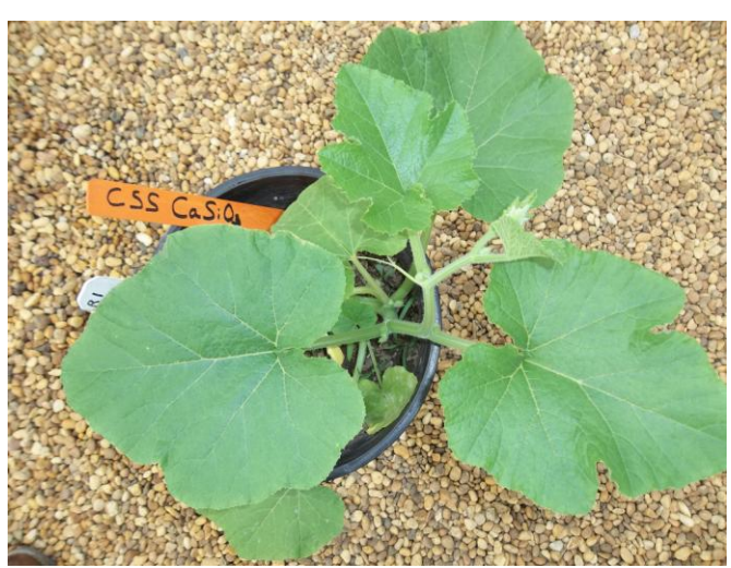
Calcium silicate slag, CSS, AgrowSil<sup>TM</sup>