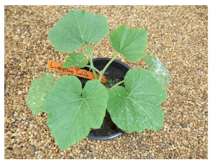
Calcium carbonate, limestone