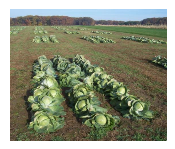
Greenhouse Studies on Silicon -Kentucky Bluegrass

In July 2011, cabbage was transplanted into the plots. Since the soil pH level was 6.5 for the amended plots, no additional calcium carbonate or calcium silicate slag applied. The soil pH = 5.5 in the no lime plots. Marketable cabbage head yields in tons per acre were 30.0 from the no lime plots, 31.5 from the calcium carbonate plots and 32.8 from the calcium silicate slag plots.