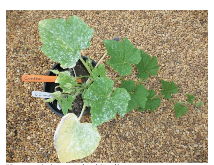
Unamended, control acid soil

A substantial body of local and international research trials shows that enhanced silicon soil fertility and nutrition helps to control powdery mildew disease on a wide variety of crops. The photos of pumpkin below illustrate the value of adding silicon to soil for suppression of powdery mildew disease.