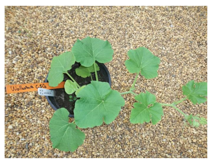
Wollastinite, natural calcium silicate