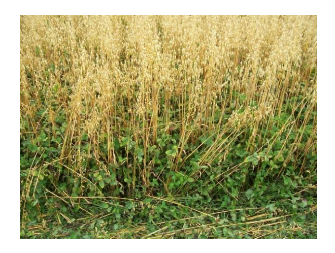
Red Clover and Orchard Grass Hay

In 2009, the same plots were seeded to oats without any additional carbonate or silicate application. Oats also served as a nurse crop to under seeded red clover and orchard grass. Grain yield averaged 48 Bu/acre for the calcium carbonate plots and 50 Bu/acre for the calcium silicate slag plots.